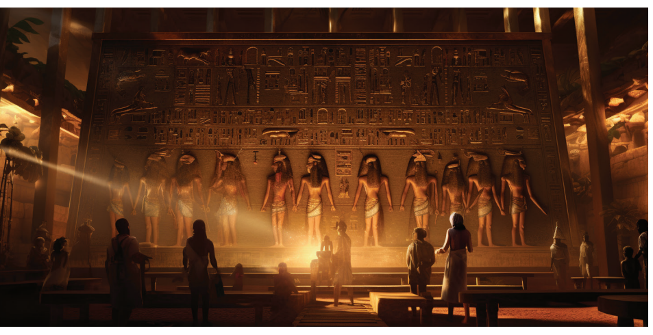
ABOVE: Hailed as a gift from the gods, the heirloom becomes the centerpiece of rituals that echo through the annals of Ancient Egypt.

The saga begins with the high priests of the early kingdom, who perceived the Heirloom as a divine gift from the gods. Its arrival in the Pharaoh's palace marked the inception of elaborate rituals, centered around the relic. The relic's divine aura influenced the high priests, giving rise to ceremonies that would shape the course of Egyptian history.